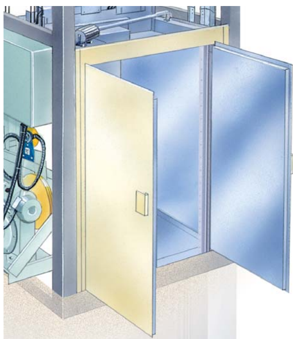
Double hinged steel door on 1305 and 1445mm wide cars

A collapsible gate is fitted to the lift car entrance as standard.