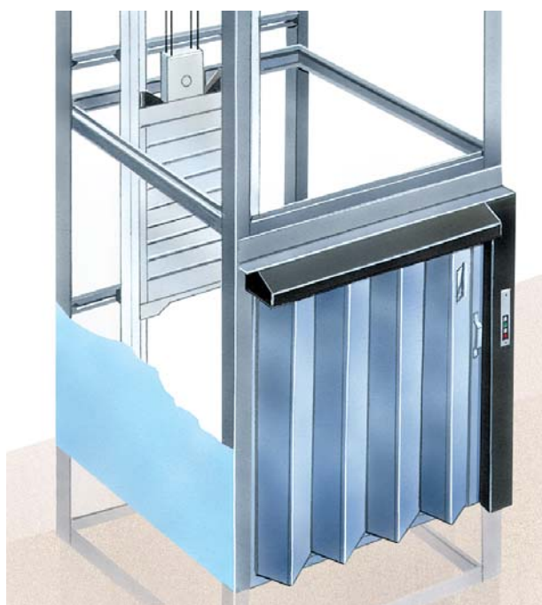
Illustration shows shutter leaf gate which can be installed as an optional extra

To protect loads during travel, a collapsible picket gate, electrically interlocked for safety, is available if required.