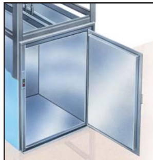
Hinged door option on 100kg Microlifts

The finish of the lift car and rise and fall shutters can be tough grey baked enamel or stainless steel.